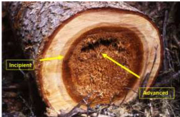
Figure 9. Incipient and advanced decay in grand fir.

base of the tree that is infused with water and appears water soaked or discolored (Filip et al. 1984). It is not incipient decay, although it often affects the grade of lumber manufactured from it.