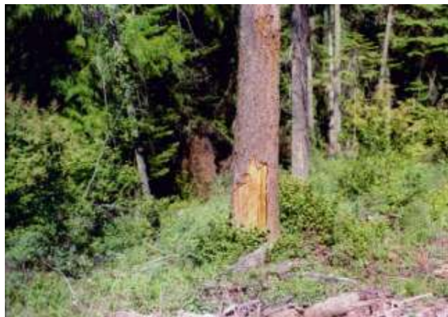
Figure 11. Tree injured during harvest operations.