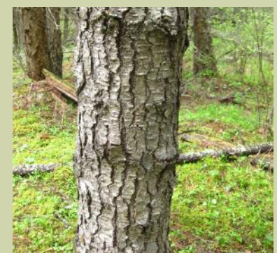
Figure 4. Fir engraver "blowouts" on live tree indicating unsuccessful attack.