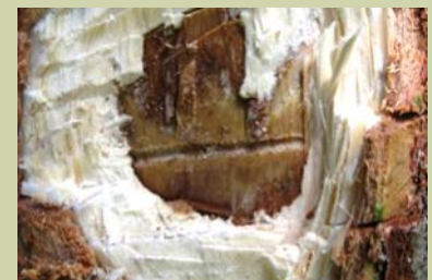
Figure 3. Old fir engraver gallery under green wood of live tree.