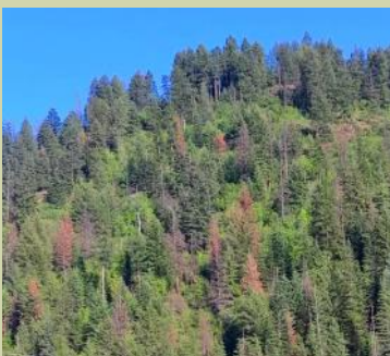
Figure 5. Grand fir killed by fir engraver beetles on west facing slope, May 2016.

Reduce Host Component in Stand The most effective way to reduce losses to fir engraver is to reduce the amount of grand fir growing in the stand. In northern Idaho, grand fir is much more prevalent than it was historically. Grand fir growing on drier sites is more likely to be attacked by fir engraver. If it is consistent with the landowner's management objectives, converting stands to tree species better adapted to drier sites and those less susceptible to root disease may be the best option.