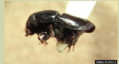
Figure 1. Adult fir engraver beetle showing concave abdomen.

The first indication of attack is reddish brown boring dust in the bark crevices or around the base of green trees during the summer months. Pitch tubes, often seen with some pine bark beetles do not occur with fir engraver. Beneath the bark, horizontal galleries can be observed (Figure 2), which are diagnostic for fir engraver. The concave abdomen of adult beetles (Figure 1) is also diagnostic.