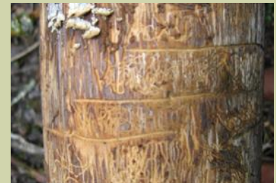
Figure 2. Typical horizontal galleries of fir engraver beetle in grand fir.