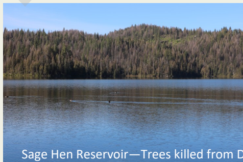
Sage Hen Reservoir—Trees killed from Douglas fir Tussock Moth infestation