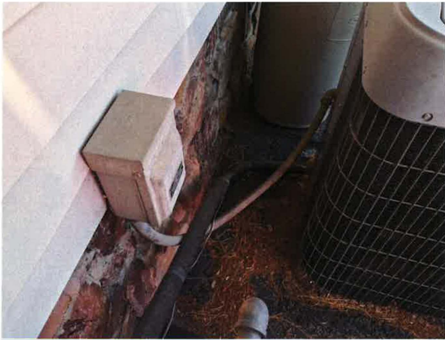
Figure 2 Existing exterior unit hookups.