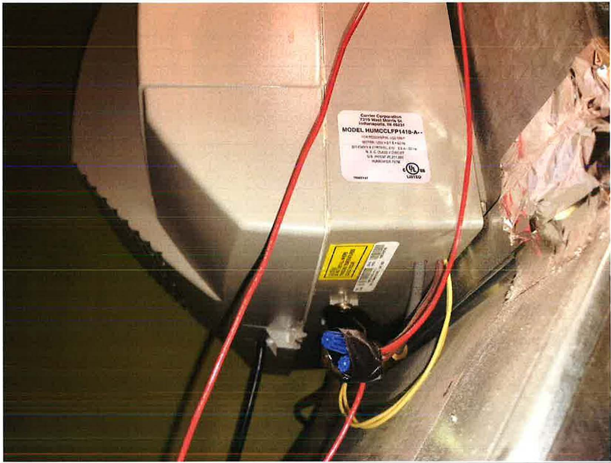
Figure 8 Existing interior unit.