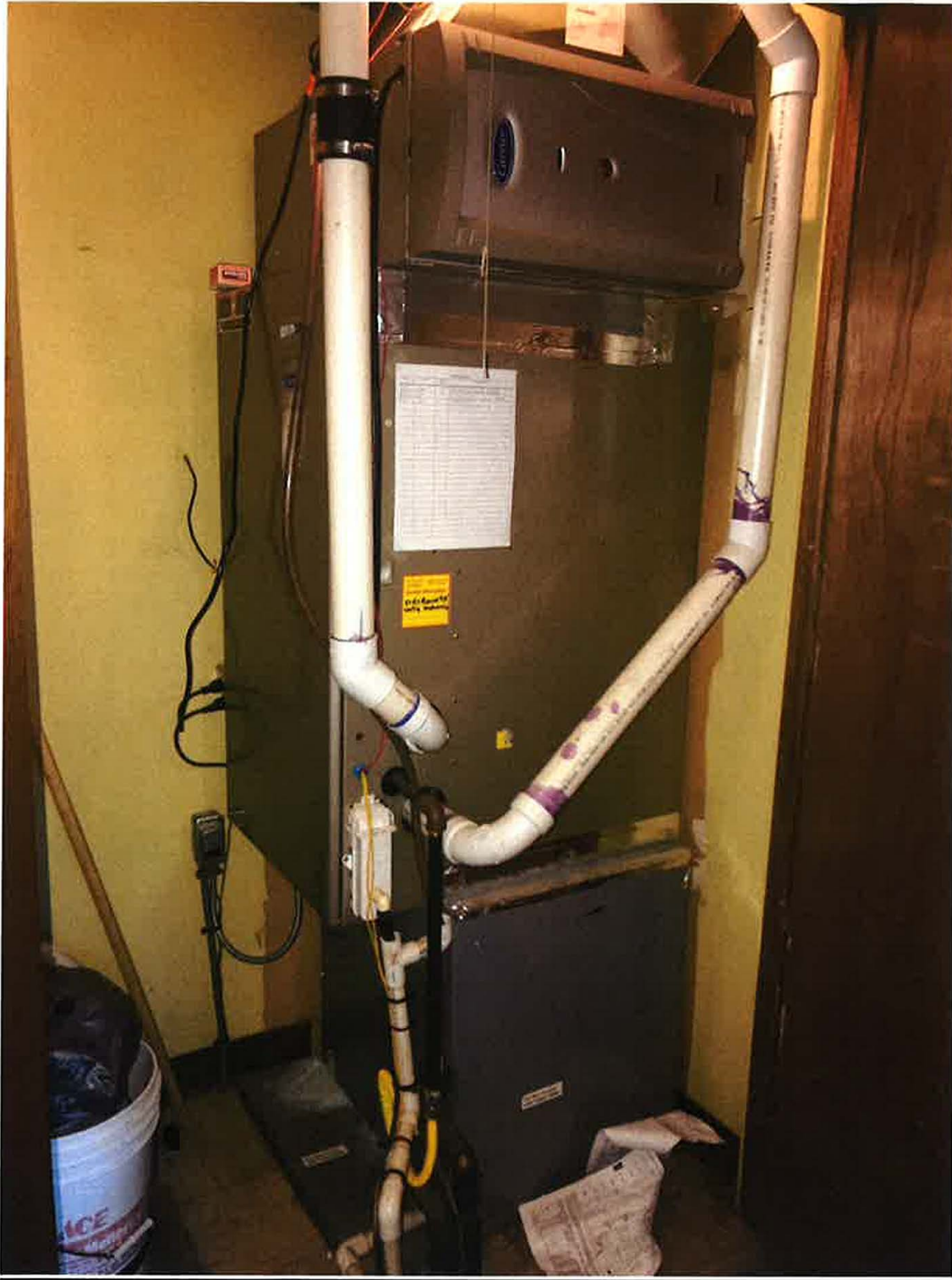
Figure 7 Existing interior unit.