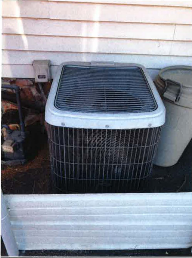
Figure 1 Existing AC exterior unit.