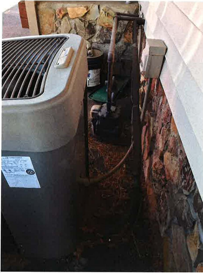
Figure 4 Existing exterior unit hookups.