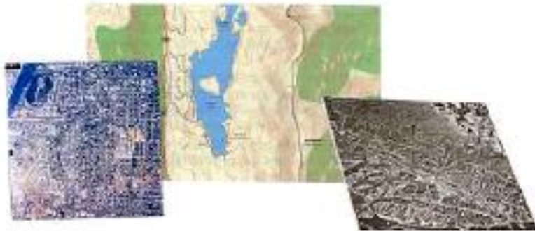
Maps & Aerial Photos