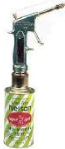
Tree Marking Gun