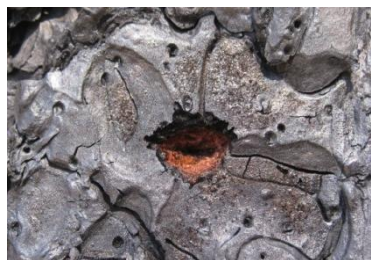
Wood borer egg niche on scorched ponderosa pine bark