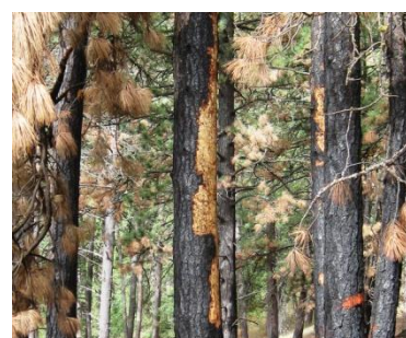
Wood pecker activity indicates borer or bark beetle infestation