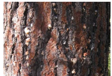
Western pine beetle pitch tubes on ponderosa pine