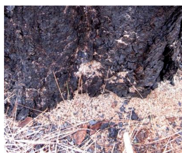
Longhorned borer frass around base of fire scorched tree