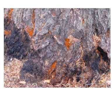
Douglas-fir beetle frass on scorched tree