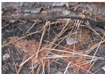
Wood borer frass under fallen log