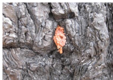
Red turpentine beetle pitch tube on ponderosa pine