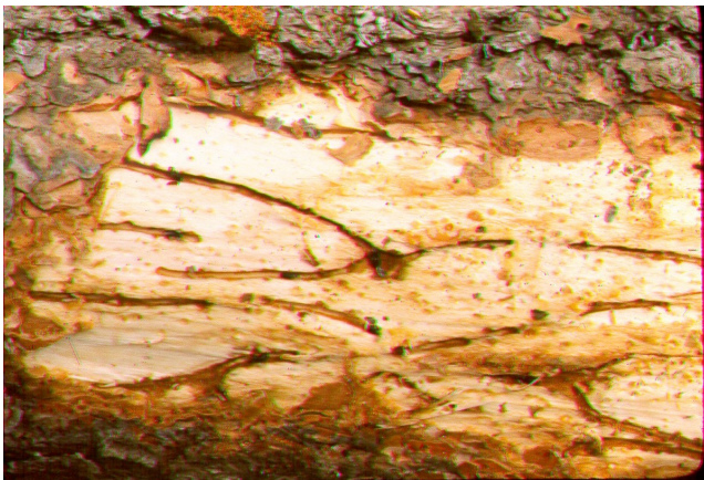
Pine Engraver egg gallery

The female beetle lays her eggs in niches cut in the side of the gallery. The eggs hatch in 4-14 days. The larvae mine laterally from the egg gallery for 1 or 2 inches, feeding for 10-20 days. When fully developed each larva pupates,