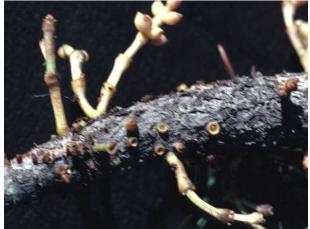
Figure 3. Basal cups, plants, and spindle-shaped swelling on branch of lodgepole pine.

The jointed stems have opposite pairs of small, scale-like leaves. Male and female dwarf mistletoe plants grow separately and can live for several years. New plants can grow from the same infection site. A small cup-like structure called a basal cup remains when dwarf mistletoe shoots fall off a branch (Figure 3).