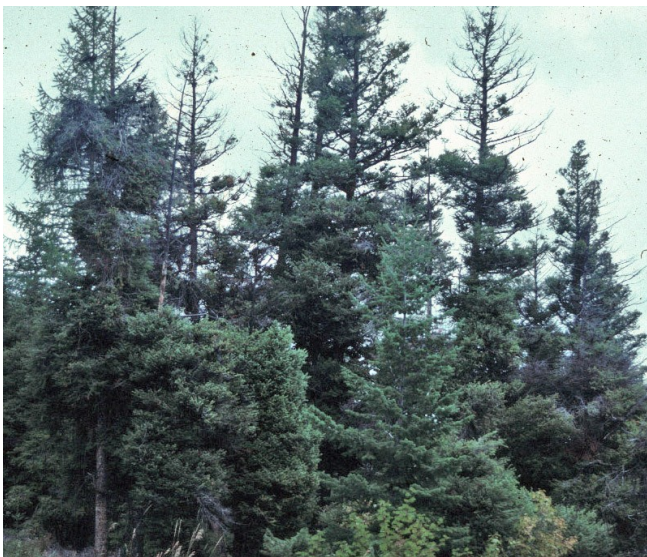
Figure 8. Severe infections in Douglas-fir.

lightly infected by dwarf mistletoes. However, dwarf mistletoes can spread and intensify over the life of a stand due to seed dispersal, so the