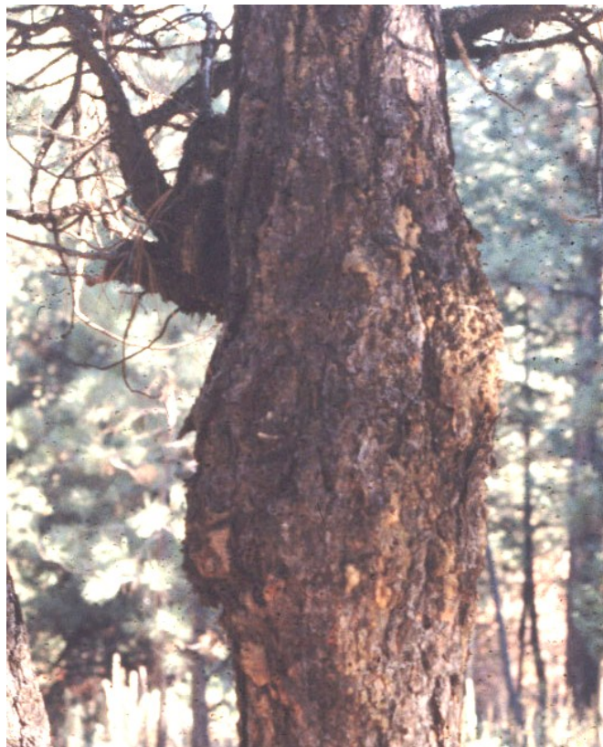
Figure 5. Bole canker of ponderosa pine caused by dwarf mistletoe stem infection.