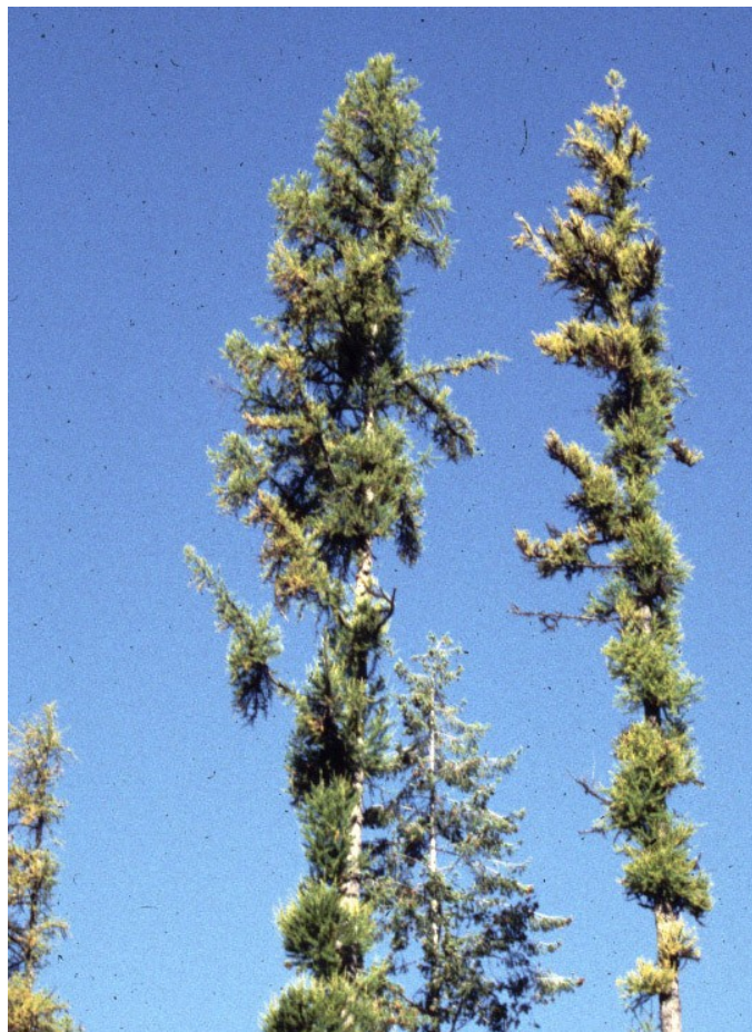
Figure 6. Witches' brooms in crowns of infected western larch. Tree on left has a DMR of 4-5, while tree on right has a DMR of 5-6.

(Figures 6-8). Large brooms commonly form in the lower portion of a tree's crown where plants have existed for the longest time. Large brooms can also cause a branch to become greatly thickened close to the bole. If a broom is accessible from the ground, check it closely for dwarf mistletoe plants or basal cups. If brooms are inaccessible, look for any that have fallen around the base of the tree and examine them for basal cups or fragments of dead mistletoe plants.