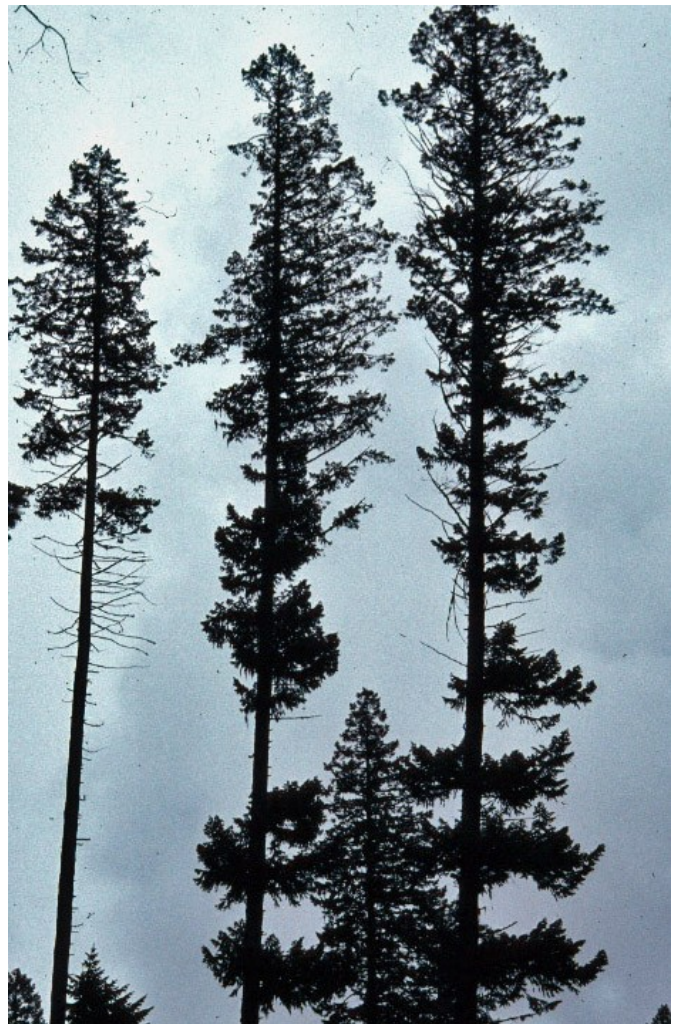
Figure 9. Stimulation brooms in thinned Douglas-fir.