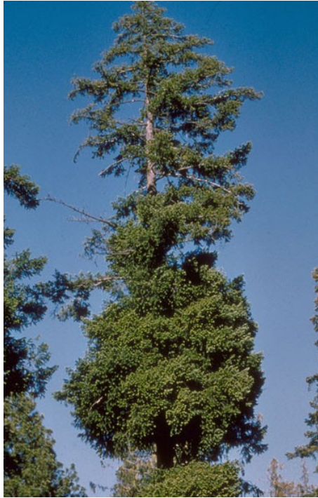
Figure 7. Large, dense witches' brooms in Douglas-fir.

Little damage may occur when trees or stands are