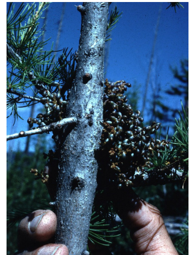
Figure 4. Spindle-shaped branch swelling and dwarf mistletoe plants on western larch.

The most obvious symptom of dwarf mistletoe infection is a witches' broom; a clumping of branches and needles. These form over time due to altered host physiology in an infected branch