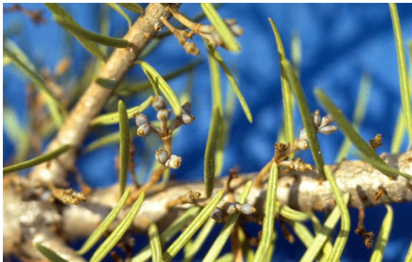
Figure 2. Dwarf mistletoe plants ( A. douglasii ) growing from a Douglas-fir. Note size of the mature mistletoe plants compared to the length of needles.

The jointed stems have opposite pairs of small, scale-like leaves. Male and female dwarf mistletoe plants grow separately and can live for several years. New plants can grow from the same infection site. A small cup-like structure called a basal cup remains when dwarf mistletoe shoots fall off a branch (Figure 3).