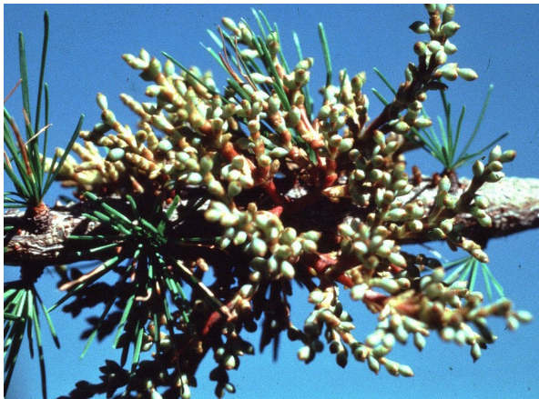
Figure 1. Female, seed-bearing plant of A. laricis on western larch.

Dwarf mistletoes are small, perennial, seed-bearing higher plants with shoots ranging from only a few tenths of an inch to several inches in height (Figures 1-2).