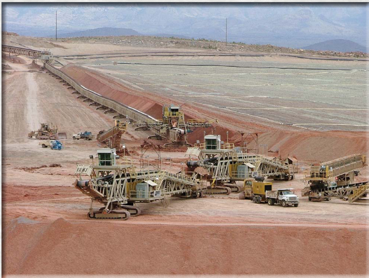
Stack loading at heap leach operation, Morenci, Arizona