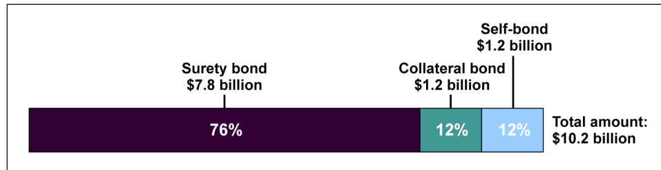
Figure 1: Amount of Financial Assurances Held in 2017, by Type, for Reclaiming Coal Mines in States and on Indian Tribal Lands with Active Coal Mining

Sources: GAO analysis of information provided by state regulatory authorities and the Office of Surface Mining Reclamation and Enforcement. | GAO-18-305