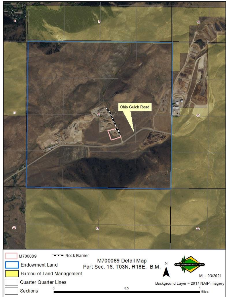
Exhibit D: LEASE MAP

DISCLAIMER: The Idaho Department of Lands (IDL) provides this product for informational purposes only. Consumers of this information should review or consult the primary data and information sources to ascertain the viability of the information for their purposes. IDL provides these data in good faith and in no event shall be liable for any incorrect information, result or analysis, any lost profits and special, indirect or consequential damages to any party, arising out of or in connection with the use or the inability to use the data or the product provided. IDL makes this data and product available as a convenience to the public, and for no other purpose. IDL reserves the right to change or revise published data and/or the product at any time.