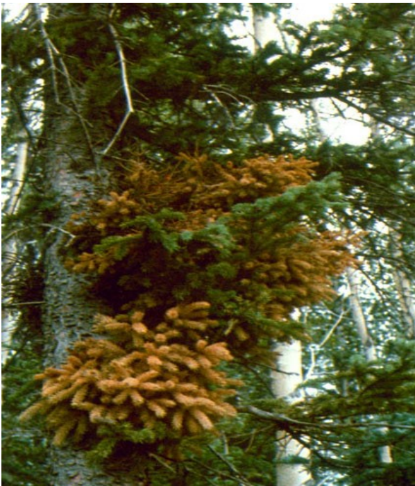
Figure 1. Witches'-broom in spruce.

Broom rusts are fungus-caused diseases that result in the formation of witch's-brooms in the branches of infected trees. "Witches' broom" is a generic term for a localized proliferation of twigs with short internodes on a branch (Figures 1 & 2). Two broom rusts occur in Idaho. Spruce broom rust, caused by Chrysomyxa arctostaphyli , infects Engelmann spruce. Fir broom rust, caused by Melampsorella caryophyllacearum , can be found on grand and subalpine fir.