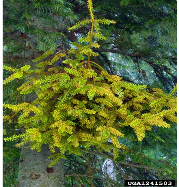
Figure 2. Witches'-broom in true fir.