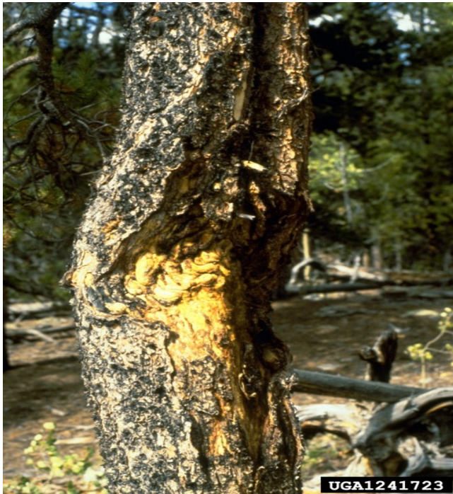
Figure 5. Lodgepole pine with classic “hip” canker in stem.