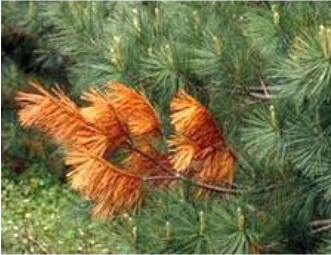
Figure 4. A typical “branch flag” caused by a blister rust canker girdling a branch.

these contain the spores that will infect Ribes leaves.