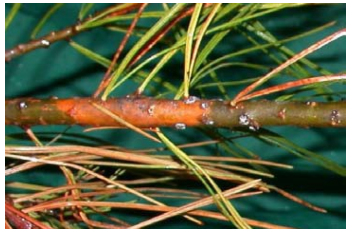
Figure 3. Early stage of branch infection. Note cluster of dead needles in discolored area; this likely holds the needle where the infection began.

Dead branches with brown or red needles, called "flags", are usually the first easily-observed symptom of WPBR. Flags are normally present throughout the year (Figure 4). The fungus grows down the branch towards the main stem at a rate of about two inches per year. As it grows, a sunken