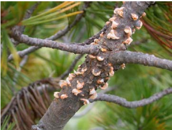
Figure 2. Distinctive blister-like structures that form on cankers of infected white pine which produce spores that infect Ribes in early spring.

Dead branches with brown or red needles, called "flags", are usually the first easily-observed symptom of WPBR. Flags are normally present throughout the year (Figure 4). The fungus grows down the branch towards the main stem at a rate of about two inches per year. As it grows, a sunken