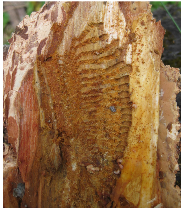
Each egg is laid in an individual niche.

Since Douglas-fir beetle outbreaks are normally initiated by catastrophic events that cause a lot of downed or weakened trees, timely salvage of at-risk Douglas-fir is a primary tool in preventing Douglas-fir beetle outbreaks. Salvage needs to be accomplished either before the beetles attack, or before they can emerge the following spring. If trees are hauled out of the woods with beetles in them,