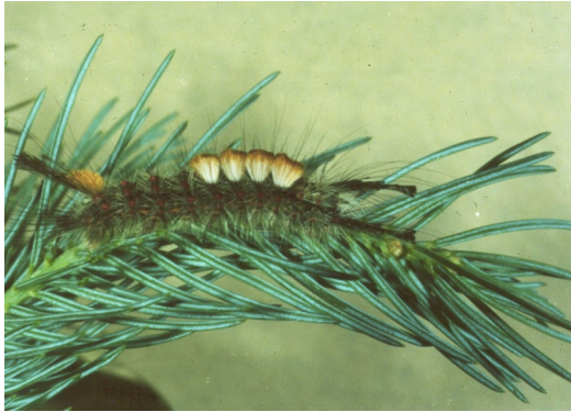
Douglas-fir tussock moth larva

The Douglas-fir tussock moth is a native insect found throughout the range of its Douglas-fir