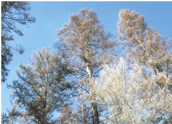
Trees defoliated and killed by tussock moth caterpillars

The insect is known for its periodic outbreaks on a 7 – 10 year cycle. During outbreaks, severe timber losses have occurred due to tree mortality, reduced radial growth and top kill.