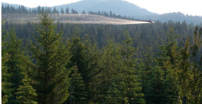
Aerial pesticide application