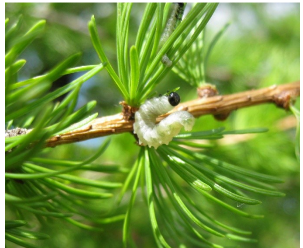
Figure 3. Defensive or alarm posture of a larch sawfly larva.

Most sawflies only have one generation per year. Females lay eggs inside the needles or shoots of their host plant using their saw-like ovipositor (giving this group its common name). A common sawfly on ponderosa pine in Idaho ( Neodiprion autumnalis ) lays its