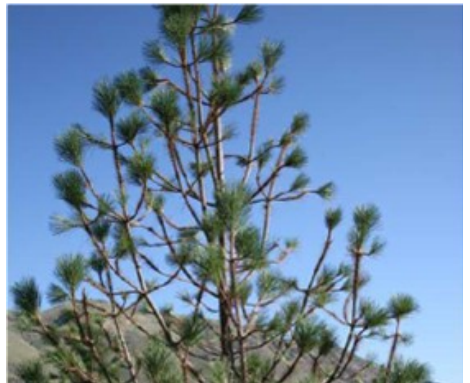
Figure 6. Damage to older needles of ponderosa pine, leaving new growth at the ends of branches.

Since most pine feeding sawflies prefer to feed on