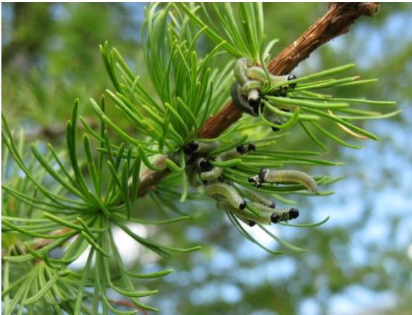
Figure 1. Sawfly larvae feeding on western larch foliage.

Larvae usually feed gregariously, and often