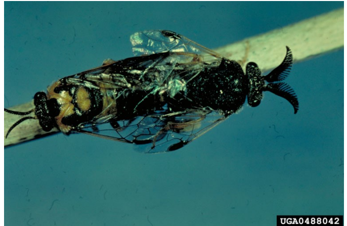
Figure 5. Mating conifer sawflies. Compare the antennae of the female (left) with the feathery antennae on the male (right).

Larvae resemble caterpillars, but can be separated by the number of abdominal prolegs (false legs) that they possess. Sawfly larvae have 6 or more pairs of abdominal legs, while moth and butterfly caterpillars have 5 or fewer pairs (Figure 4). Adults are non-stinging wasps that do not feed, and are rarely observed. Males have feathery antennae,