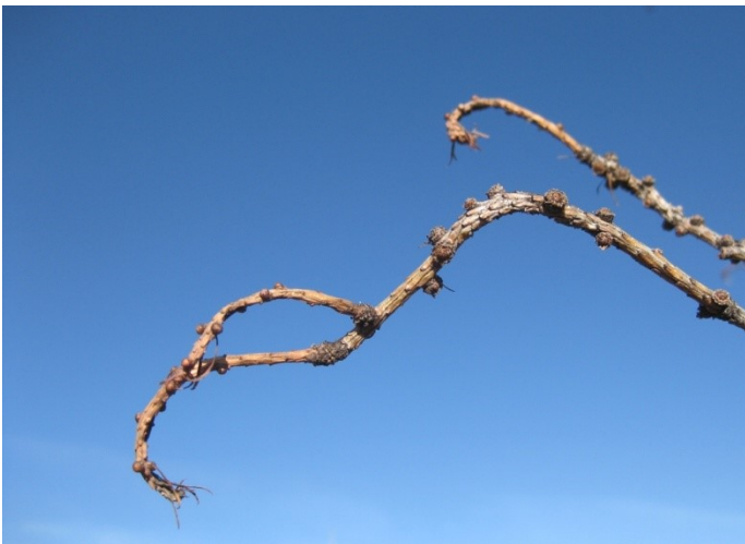
Figure 7. Damage to larch branches from sawfly oviposition.

Sawfly outbreaks rarely require direct control measures. Outbreaks are generally only a problem in plantations of young trees, where the growth