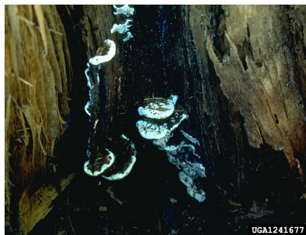
Figure 6. Fruiting bodies, or conks, of S-type H. annosum .