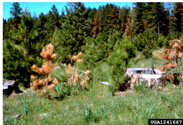
Figure 1. Heterobasidion root disease mortality adjacent to a hollow ponderosa pine stump.

Dustin Miller Director Idaho Department of Lands 300 N. 6th Street, Suite 103 Boise, ID 83720 Phone: (208) 334-0200