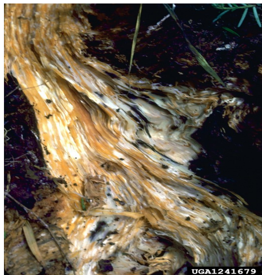
Figure 5. Advanced decay caused by H. annosum .

Root disease management should be site-specific and based on stand management objectives, the root disease or disease complex present, estimates of root disease severity, stand structure and composition, and stand history. Management of Heterobasidion root disease varies by forest type and location so the following recommendations should be viewed as guidelines.