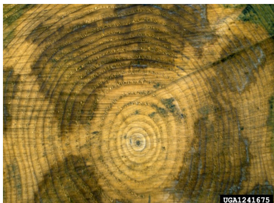
Figure 4. Stain on stump caused by incipient decay.

are perennial, woody to leathery, light-gray to dark-brown on top, with a creamy-white, small-pored underside (Figure 6). They are often shelf-like and vary in size from very small “button-conks” to fairly large ones.