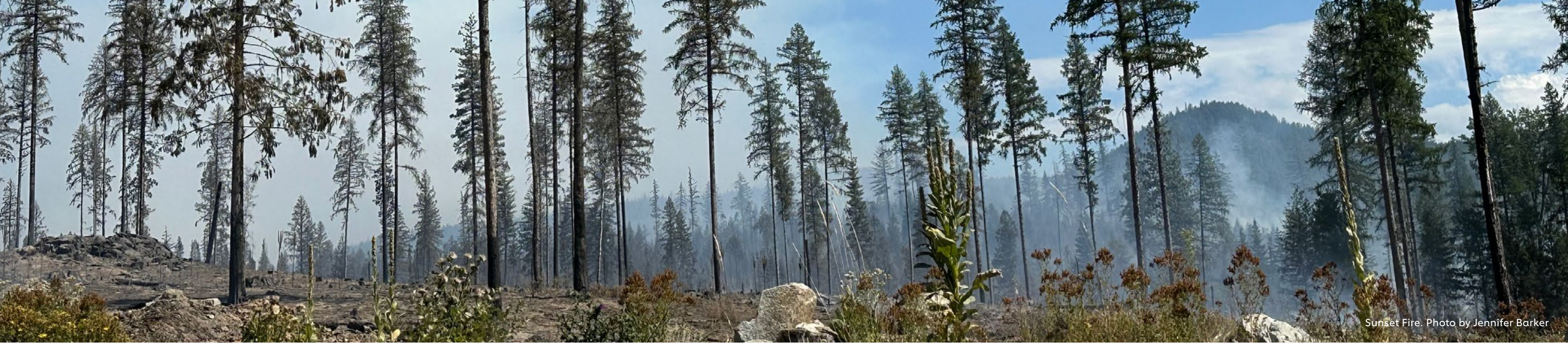
Sunset Fire.