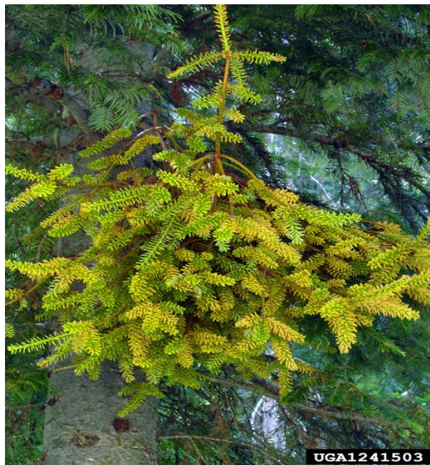
Figure 2. Witches-broom in true fir.