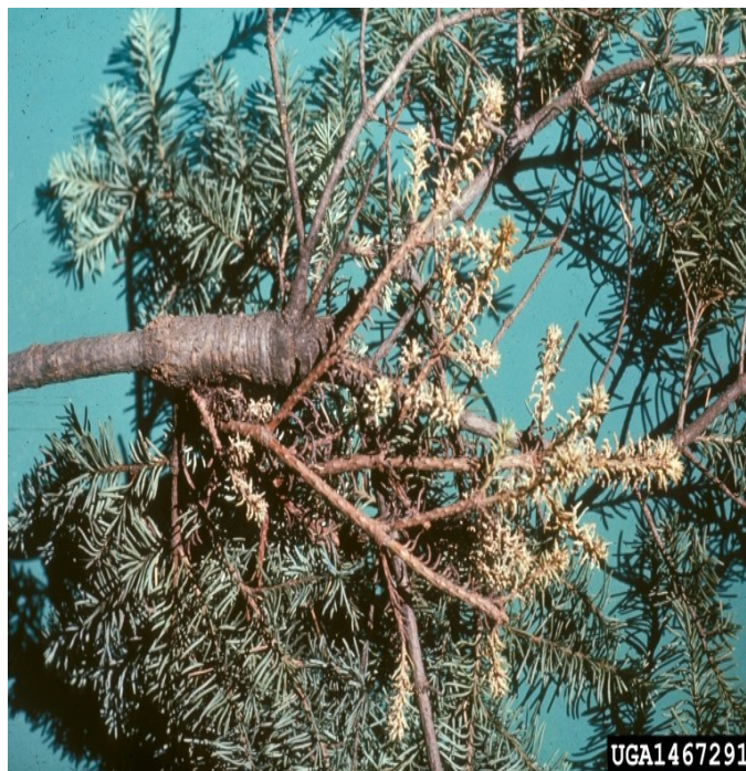
Figure 4. Spindle-shaped swelling associated with a witches-broom on true fir.

Witches-broom can be caused by other diseases as well, most notably dwarf mistletoes on various conifer species and Elytroderma needle cast on ponderosa pine. Therefore, the presence of a broom is not diagnostic of any specific disease. By carefully identifying the host on which the broom is growing, and examining the broom for the characteristics associated with broom rust, this disease can be diagnosed readily.