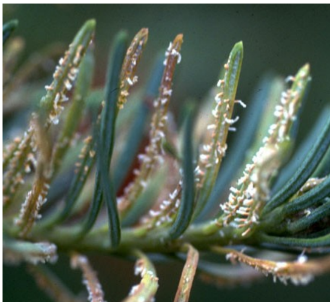
Figure 3. Fungus fruiting from infected needles in summer.

and thicker than needles on normal branches. In early summer bright-yellow or light-orange tongue-like structures protrude from the needles of a rust broom (Figure 3). These structures produce airborne spores that disperse to infect the alternate hosts.