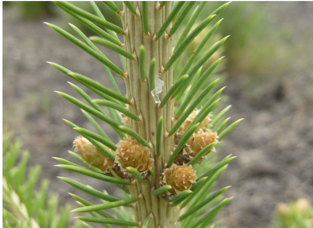
Figure 6. Pitch flow associated with feeding punctures and egg laying activity.

with elongated, downward pointing mouthparts (Figure 4).