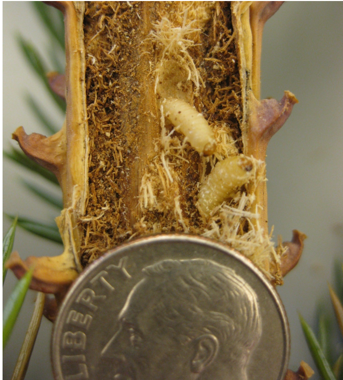
Figure 3. Larvae and pupal chambers (note “chip cocoons”).

larvae feed underneath the bark and tunnel in the pith, mining the new growth until pupation. Larval feeding girdles the terminal, and by late summer, the new growth wilts, the needles turn red and