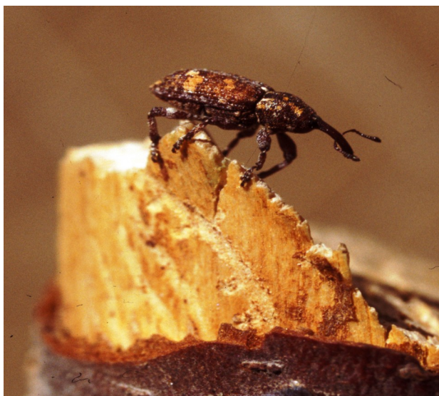
Figure 1. Engelmann spruce weevil adult. (Photo by L. Livingston, Idaho Department of Lands).

The Engelmann spruce weevil (ESW), also known as the spruce weevil or white pine weevil (Figure 1), is a beetle that can cause severe damage to the terminal growth of native and ornamental spruces and certain pines.