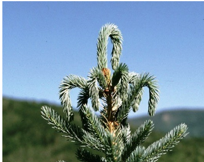
Figure 7. Killed terminal with "shepherd's crook" form.

As these infested leaders die, healthy lateral branches assume apical dominance. Infested trees are rarely killed outright, but may have such poor form that they are unsuitable for reforestation or landscape use (Figure 8). The dead tops can persist for several years and can become an entry point for decay fungi. Chip