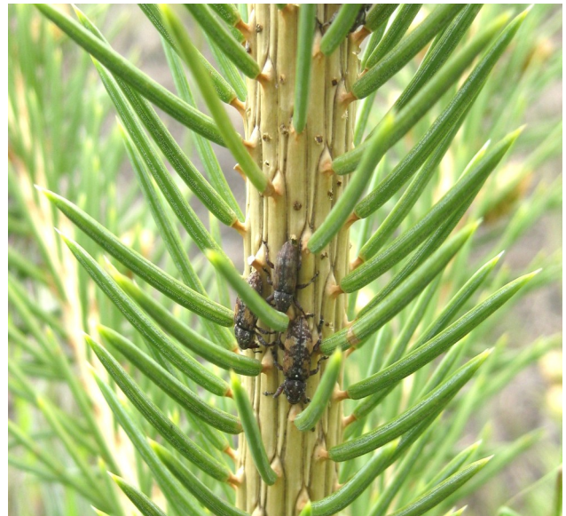
Figure 4. Adult Engelmann spruce weevils on blue spruce.

The chip cocoon is located under the bark, partly inside the sapwood and is a distinguishing feature of ESW infestations. Adults emerge in late summer or early fall, and may feed on needles or buds before seeking sheltered places to overwinter.