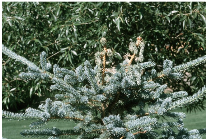
Figure 8. Codominant stems on blue spruce after ESW attack.

C ontrol of this pest is difficult, especially in areas with a history of infestations. Since ESW prefers open-grown trees, close spacing and replanting in small blocks that limit available light can reduce weevil damage. In the eastern United States, replanting eastern white pine at high stocking levels