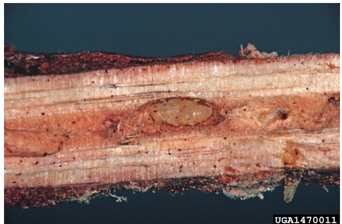
Figure 5. Cream colored pupae inside chip cocoon.

E ngelmann spruce weevil is one of approximately 20 species of closely related weevils in the genus Pissodes . A closely related species, P. terminalis , attacks lodgepole pine in the northern Rockies. ESW adults are mottled brown-and-white beetles