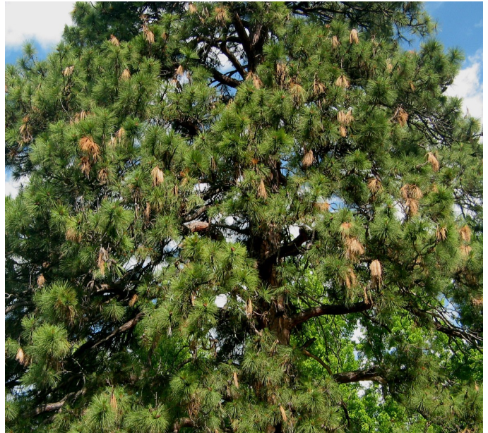
Figure 4. Shoot dieback distal to western gall rust infections in mature, heavily-infected ponderosa pine.

Galls located near the ends of branches often die from secondary fungi and/or insect infestation. This kills the portion of the branch beyond where the gall was located, causing a “flag,” or dead branch with red foliage, to be visible (Figure 4).