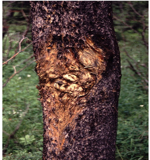
Figure 2. Trunk or "hip" canker on stem of lodgepole pine.