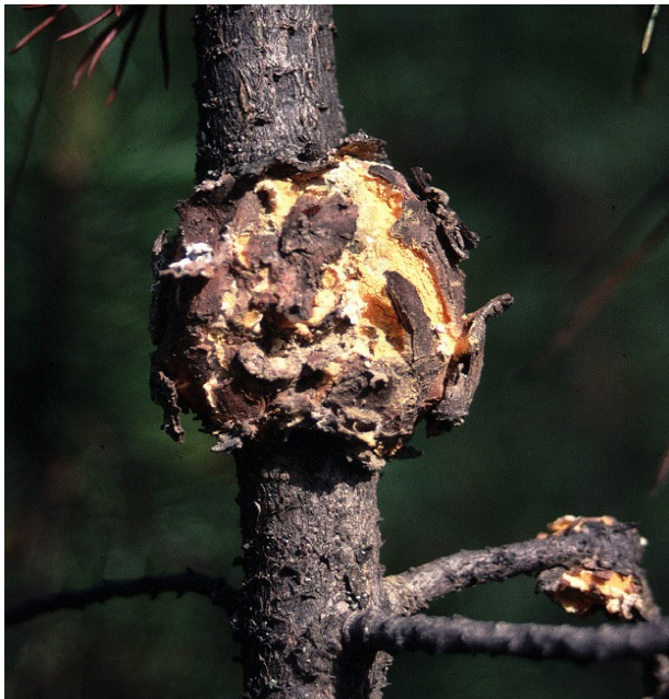
Figure 1. Typical, medium-size gall of western gall rust.

Western gall rust, caused by the fungus Endocronartium harknessii , is a very common branch and stem disease of ponderosa and lodgepole pines (Figures 1 & 2). It is a native disease in the western United States and occurs throughout Idaho. Damage is generally more severe in the southern portion of the state. Western white, whitebark, and limber pines are not susceptible to this fungi.