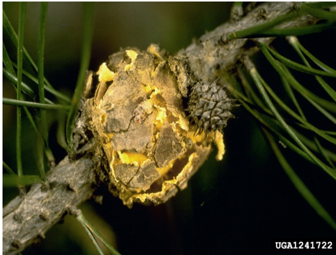
Figure 3. Sporulating gall.

windborne spores that infect the green, succulent tissue of expanding pine shoots.