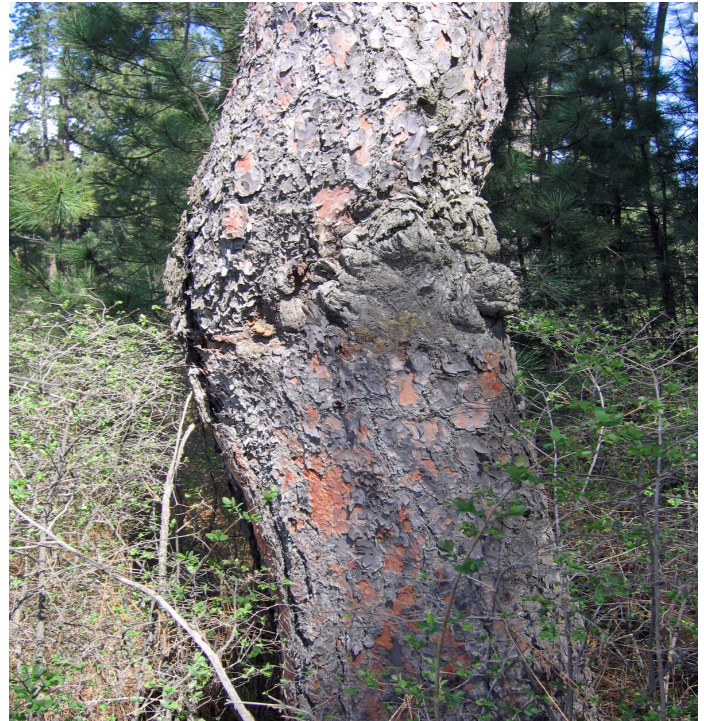
Figure 6. Large hip canker in stem of mature ponderosa pine.

Mortality, growth loss, and defect are the main types of damage caused by severe infections of western gall rust, but their impact varies greatly by locality and tree age. Mortality is most common when seedlings and saplings are infected, but sometimes poles and small saw-timber-size trees are killed. Some trees, particularly ponderosa pine, can develop hundreds of branch cankers and suffer growth reductions. Defect caused by western gall rust is due to trunk cankers (Figures 5 & 6). Tree stems are frequently weakened where cankers occur and can break off in the wind. Trees with bole cankers in recreation sites or near homes can pose a hazard.