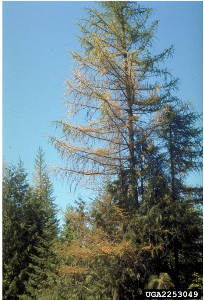
Figure 4. Foliage discoloration due to larch casebearer.

in the summer. Repeated, long term defoliation by the larch casebearer can cause growth reduction, branch dieback, top kill, and eventually death. Weakened trees are more likely to be attacked by borers or bark beetles.