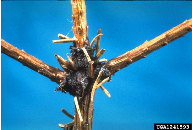
Figure 3. Third instar larvae overwintering.

In the spring, larvae molt to the fourth instar as the new needles develop, and continue to feed on the new growth. Pupation takes place within the case, and adults emerge in June or July.