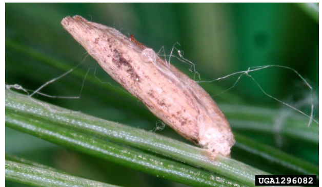
Figure 2. Larval case of larch casebearer.

Larch casebearer has one generation per year, and like all moths, has four life stages. Eggs are laid singly on the undersides of needles in late June or July depending on elevation and latitude. Larvae hatch in approximately two weeks, boring directly through the egg into the needle. Larvae feed exclusively inside the needle for approximately two months. Third instar larvae then make a protective case from a hollowed out needle, and line it with silk (Figure 2).