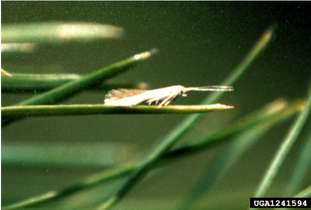
Figure 1. Larch casebearer adult.

The larch casebearer (Figure 1) is a pest of western larch in the Inland Northwest.