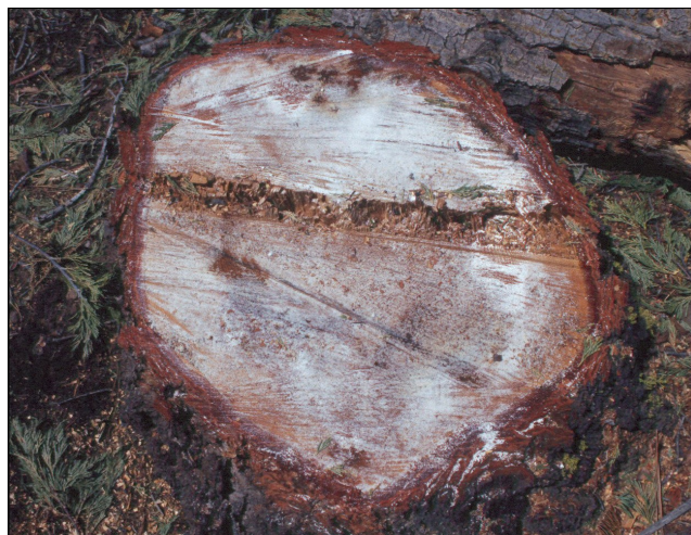
Figure 7. Pine stump treated with borax to prevent spore infection

Only stumps 14” and greater in diameter are recommended for treatment due to the greater likelihood of root contact between roots of large stumps and surrounding live-trees, and because smaller material decays faster and will be available as sources of infection for less time.