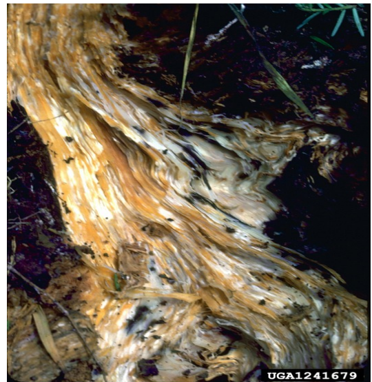
Figure 5. Advanced decay caused by H. annosum .

Root disease management should be site-specific and based on stand management objectives, the root disease or disease complex present, estimates of root disease severity, stand structure and composition, and stand history. Management of annosus root disease varies by forest type and location so the following recommendations should be viewed as guidelines.