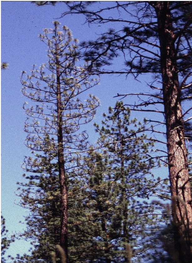
Figure 2. Annosus root disease symptoms in mature ponderosa pine

Key point: A general rule-of-thumb is only about half of all root disease-infected trees can be detected by above-ground symptoms at any one time.