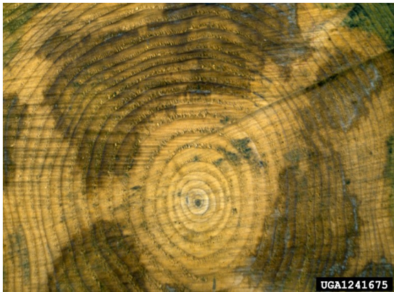
Figure 4. Stain on stump caused by incipient decay.

Positive identification of annosus root disease can be made by locating fruiting bodies, or conks, of the fungus. Conks of the S-type are typically formed inside hollow stumps of host species, within decayed wood of stumps, or on the underside of roots of windthrown trees. Those of the P-type are commonly found in stumps or in the duff layer at the root collar of infected trees. Conks are perennial, woody to leathery, light-gray to dark-brown on top, with a creamy-white, small-pored underside (Figure 6). They are often shelf-like and vary in size from very small “button-conks” to fairly large ones.