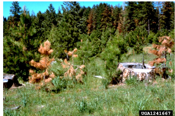
Figure 1. Annosus root disease mortality adjacent to a hollow ponderosa pine stump.

On stump surfaces, the fungus can colonize the woody tissue and grow down into the roots, but not all surface infections reach the roots, since many variables affect growth of the fungus. Once in the roots, it can infect roots of adjacent mature leave-trees or regenerating trees at root contacts and grafts by growth of ectotrophic mycelia. This fungus does not grow freely through the soil, but it can survive for several decades in large roots and stumps and cause disease in consecutive generations of forest (Figure 1).