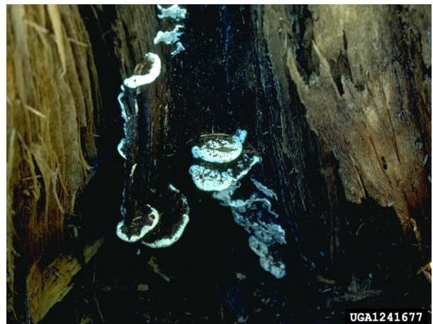
Figure 6. Fruiting bodies, or conks, of S-type H. annosum .