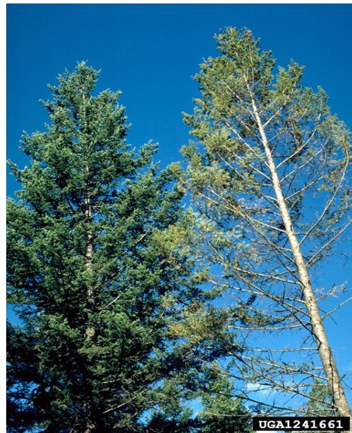
Figure 3. Typical root disease crown symptoms in Douglas-fir.

The size of an infected tree will affect expression of disease symptoms. Larger trees, with more expansive root systems, will develop symptoms more gradually than a sapling or seedling, which may succumb relatively quickly and develop few if any crown symptoms. Large trees may not show symptoms for years after infection until much of their root system has been compromised. Any susceptible tree within 30 feet of an infected tree is likely infected.