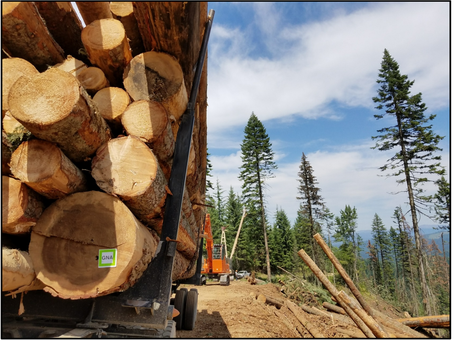
First Load - Woodrat Salvage GNA Timber Sale, Nez Perce - Clearwater National Forest